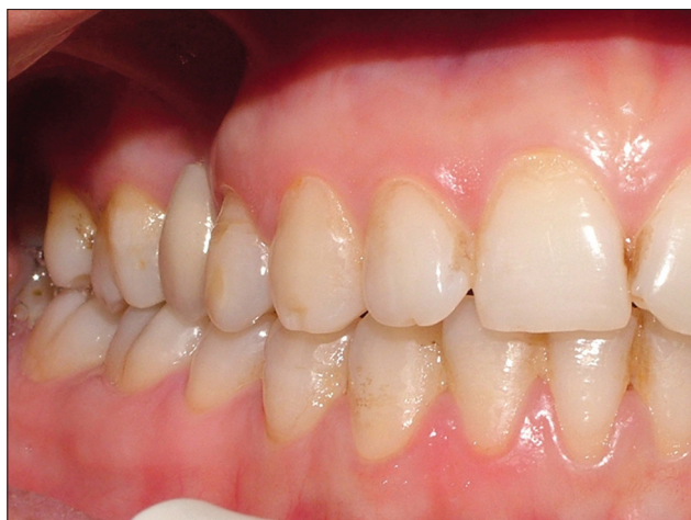
Figure 2: Buccal view of cast metal-inlay slot cavity-retained resin-bonded fixed dental prostheses for a single missing maxillary right second premolar in situ (courtesy of Dr. İzgi)

established via the personal telephone records present in the patient's file.