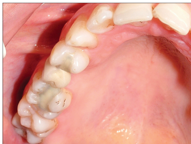
Figure 1: Occlusal view of cast metal-inlay slot cavity-retained resin-bonded fixed dental prostheses for a single missing maxillary right second premolar in situ