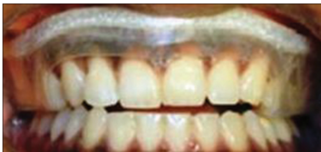
Figure 3: Liquid supported splint inserted in patient's mouth

The obtained data were subjected to statistical analysis using IBM SPSS software (version 20.0, Chicago, IL, USA). Tukey test was used to compare the values of the Mod-SSI between three groups at all times. Kruskal–Wallis H-test was used to analyze the scores of digital palpation, both between groups and each groups at all times. Differences were considered statistically significant at P \leq 0.05 .