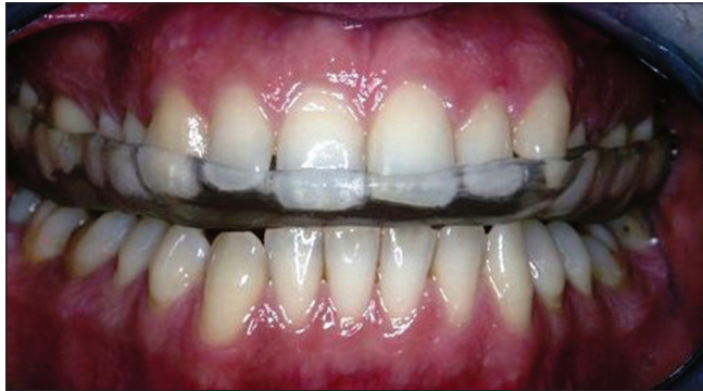
Figure 1: Hard splint inserted in patient's mouth