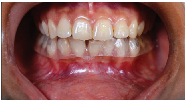
Figure 2: Soft splint inserted in patient's mouth