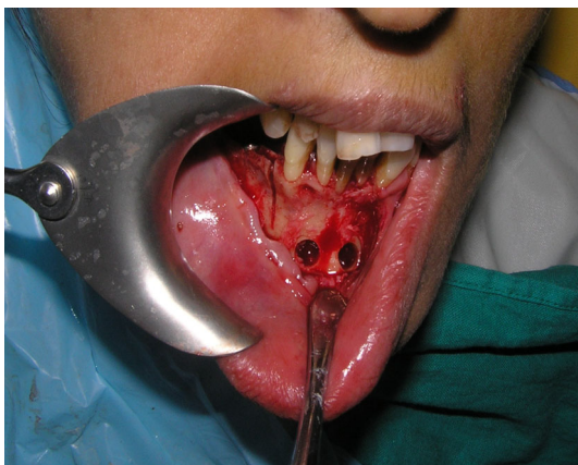
Fig. 6 Autologous graft harvested from symphysis region

distal ends were performed with Piezotome (Fig. 9). Osteotomes of increasing width were used for further expansion of the splitted ridge. Implants of size 4.2 × 13 mm and 5 × 13 mm were placed in #20 and #19 region. The expanded crypt was packed with allograft Ossifi (Equinox) Biphasic hydroxyapatite beta tricalcium phosphate. After a healing period of 5 months the rehabilitation was done with porcelain fused to metal splinted bridge (Fig. 10).