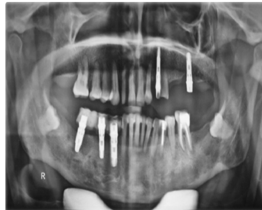
Fig. 8 Post-op orthopantomogram showing stable implants in #28, #29 & #30 region with splinted crowns