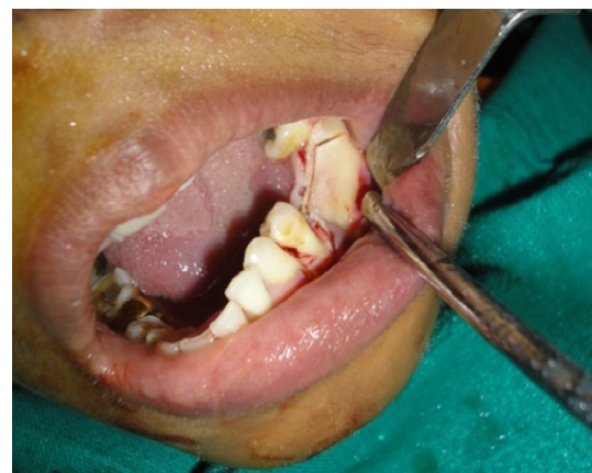
Fig. 9 Ridge splitting with midcrestal incision and mesial and distal vertical osteotomy cuts

placement. So ridge splitting was planned under local anaesthesia. A full thickness mucoperiosteal flap was elevated from first premolar to second molar. Midcrestal osteotomy along with vertical bony cuts on mesial and