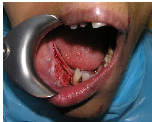
Fig. 4 Midcrestal osteotomy with anterior releasing vertical bony cut

teeth have been extracted 3 year ago for grossly carious non restorable reason. The patient has been planned for implant placement. Clinical examination revealed very thin ridge width with adequate bone height for implant