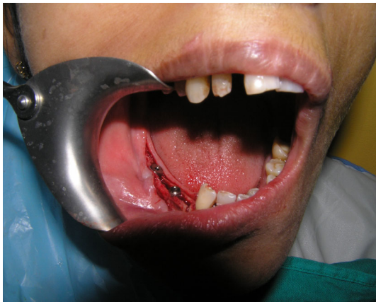
Fig. 5 Implants placed in the splitted ridge in #28, #29 & #30 region