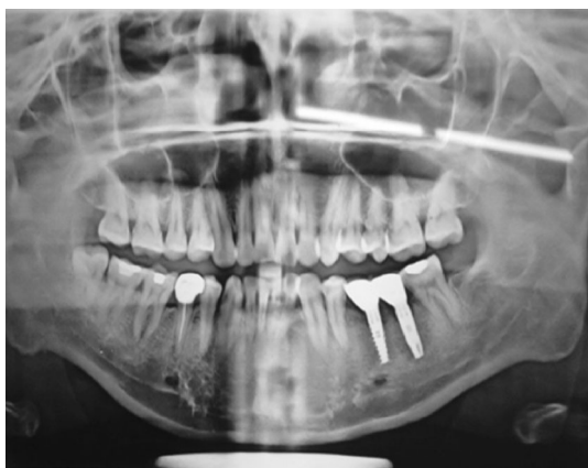
Fig. 10 Post-op orthopantomogram showing stable implanted with splinted PFM crowns n #19 & #20 region

tapered channel formers and D-shaped osteotomes to expand the resorbed residual ridge. Summers [4] later revived the interest in this technique; he reported that in 143 maxillary implants placed using the osteotome technique, only 5 failed (96 % implant survival). In 1992, Simion et al. [5] introduced a split-crest bone-manipulation technique by means of provoking a longitudinal greenstick fracture at the top of the bone that would split the atrophic crest in two parts. In 1994, Scipioni et al. [6] presented the clinical results of an edentulous ridge expansion technique. They placed 329 implants in 170 patients with success rate of 98.8 %. Sethi and Kaus [7] placed 449 implants in 150 patients in thin maxillary ridges of adequate height and comprising 2 separate cortical plates with intervening cancellous bone and observed them for a period of up to 93 months. A 97 % implant survival rate after a 5-year observation period was found.