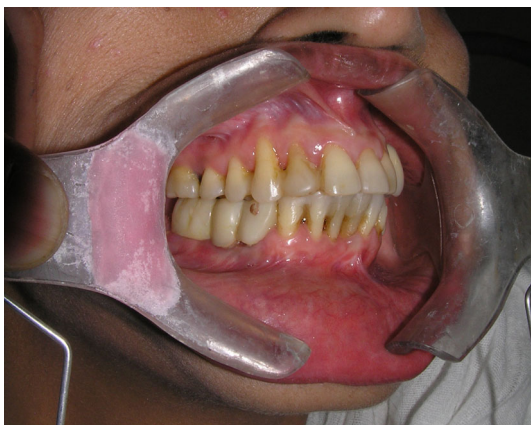
Fig. 7 Implant retained composite splinted crown in #28, #29 & #30 region

The ridge split procedure represents one form of augmentation technique for narrow ridges. The procedure can be considered for simultaneous placement of implants in addition to ridge expansion, thus reducing the overall time for implant therapy. Ridge splitting for root-form implant placement was developed in the 1970s by Dr. Hilt Tatum [3]. Tatum developed specific instruments including