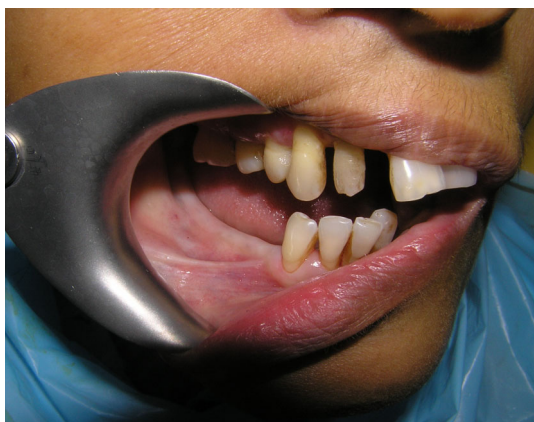
Fig. 1 Missing teeth distal to #27 with narrow ridge crest

A 24 years young female approach for replacement of missing lower left second premolar and first molar. The