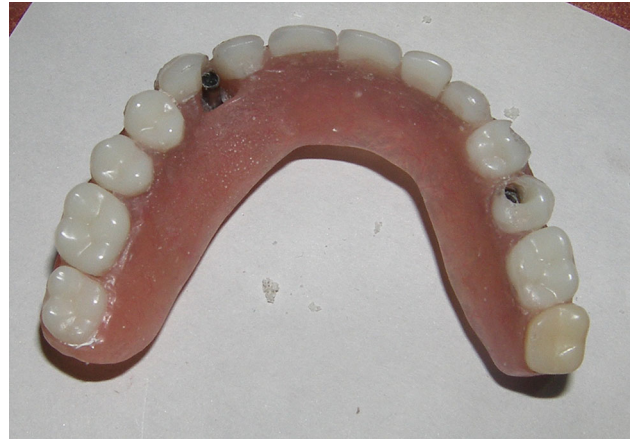
Fig. 5 Occlusal view of prosthesis

Cement retained prosthesis was not an option because of the unfavorable position and angulation of the implants. Need for an economic screw retained prosthesis made an acrylic prosthesis as the most appropriate prosthesis in this situation. The cantilever length in the first quadrant is more than that in the second quadrant because of the absence of implant in the 15 or 16 regions. An acrylic prosthesis would flex in this region resulting in deleterious forces transferred to the implant in relation to 13. Fracture of acrylic prosthesis has also been reported [6] especially in