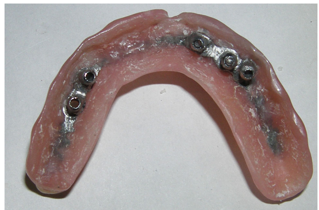
Fig. 6 Intaglio surface of prosthesis