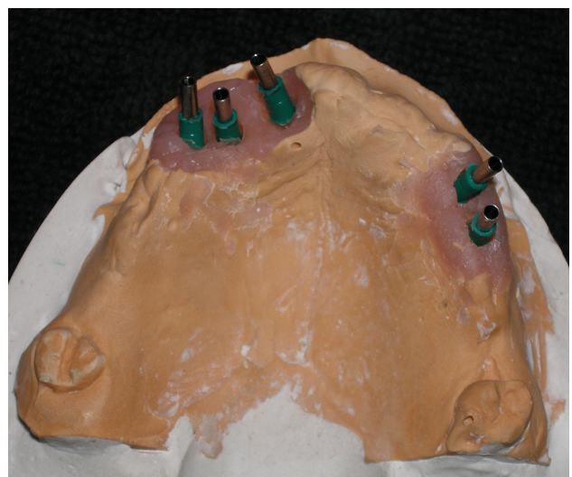
Fig. 2 Castable abutments secured to the implant analogues show the unfavorable position and angulation

The labial flange of the denture was retained for aesthetics but the palatal flange was trimmed and modified to provide access for the patient to perform routine oral