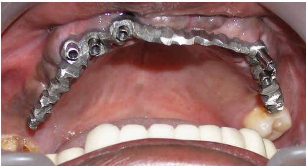
Fig. 4 Fit of abutment bar after 'Cast joining'

hygiene procedures. Denture was secured to the implants with abutment screws and occlusion checked (Fig. 7). The access holes were then sealed with composite resin and the patient was scheduled for recall on alternate days for the first 2 weeks to verify oral hygiene of the patient. Once the oral hygiene practice of the patient was found to be satisfactory and efficient, the patient was scheduled for a 6 monthly periodic recall appointment.