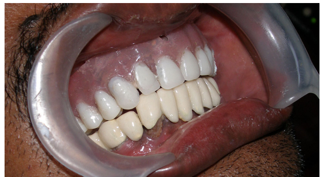
Fig. 7 Occlusion of prosthesis

case of presence of cantilever. Reinforcing acrylic provisional with a cast bar has been reported [10, 11] for use as provisional or as interim fixed denture in full mouth rehabilitation, where fracture of provisional acrylic prosthesis is common. Reinforced provisional acrylic denture leuted to milled abutments with the help of resin cement has also been reported [12]. But the use of reinforced acrylic denture as long-term implant supported prosthesis