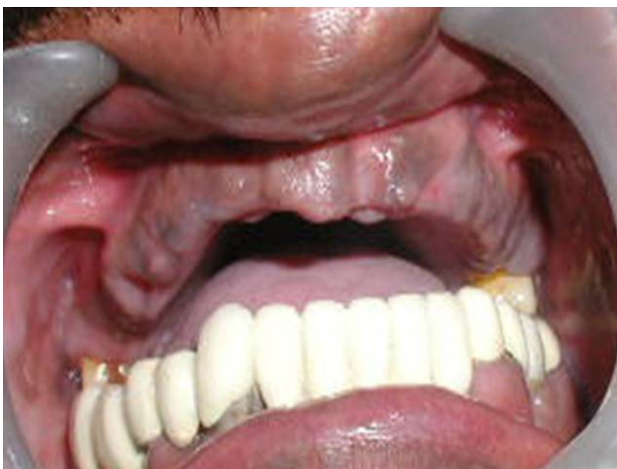
Fig. 1 Preoperative

Healing abutments were removed and impression posts were attached and secured to the implants with abutment screw. An open tray implant level impression [7] was made. Impression was removed after loosening the abutment screws, Implant analogues were fixed and Die stone cast poured. Castable abutments were fixed to the implant analogues in the cast (Fig. 2). A single bar was waxed up