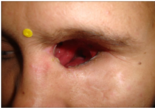
Fig. 1 Showing healed defect

Cast was sectioned in 2 parts and wax pattern was made. This wax pattern was tried on patient and was flaked and processed in heat polymerized clear PMMA (Trevalon clear; Dentsply, New York, PA, USA) using conventional technique [9]. This acrylic portion was finished and polished.