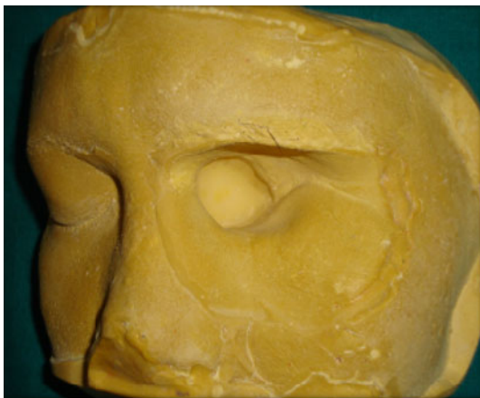
Fig. 2 Facial moulage

(3) Selection of stock acrylic eye shell : A commercially available stock acrylic eye shell was selected for the patient