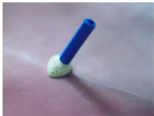
Fig. 2 Special tray with hollow handle