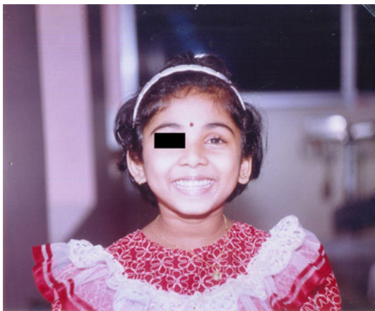
Fig. 4 Photograph of child with the prosthesis