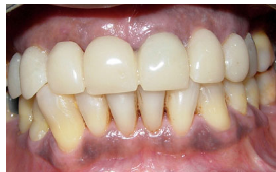
Fig. 6 Provisional restorations

Crown preparations were carried out as per the treatment plan. Interim prostheses were fabricated and inserted (Fig. 6). These were fabricated at an increased vertical