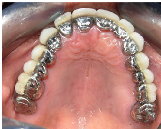
Fig. 8 Post-insertion maxillary view