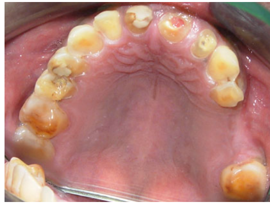
Fig. 2 Pre-op intraoral view of maxillary teeth