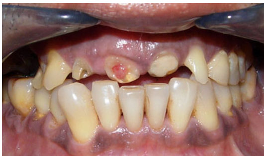
Fig. 1 Pre-op labial view

Extra-oral examination revealed an obvious overclosure from the frontal aspect indicative of reduced vertical dimensions. Intra-oral examination (Figs. 1, 2, 3, 4) revealed missing maxillary right second premolar, first and third molars and mandibular left first molar. Maxillary anterior teeth had undergone severe attrition. Maxillary right central and lateral incisors and left central incisor had practically fractured and were reduced to root stumps. The