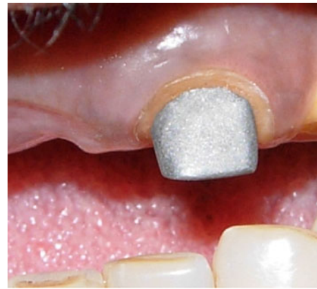
Fig. 5 Custom cast post and core (maxillary left central incisor)

In the preliminary phase the maxillary right central and lateral incisors and left second premolar and mandibular right first molar were extracted due to non-resolving periapical infection. Diagnostic casts were fabricated and mounted on a semi-adjustable articulator. A diagnostic wax up was done to analyze the need of altering the vertical dimension of occlusion, occlusal plane, tooth contours,