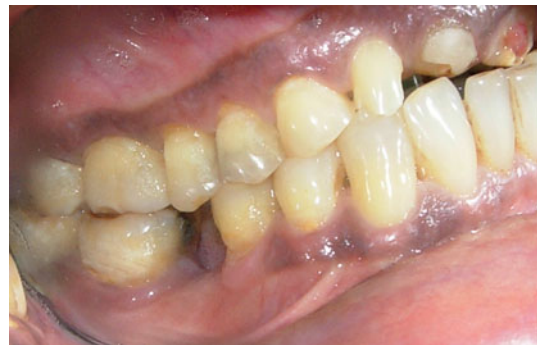
Fig. 3 Pre-op intraoral view (left side)