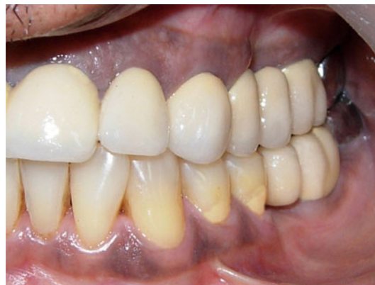
Fig. 10 Post-op intraoral view ( left side )

dimension of approximately 2.5 mm as planned. The patient was kept on an interim phase of about 6 weeks with regular review to check for any subjective symptoms of TMJ discomfort. Patient's esthetics and phonetics were checked and found appropriate. The final prosthetic phase commenced after 6 weeks. Elastomeric impressions