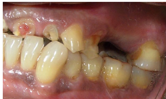
Fig. 4 Pre-op intraoral view (right side)

root stump of maxillary right central incisor showed a pulp polyp and was severely tender. Maxillary left central incisor had been root canal treated and showed a large glass ionomer cement restoration. The lack of opposition from maxillary anterior teeth had caused mild supraeruption of mandibular anterior teeth. Maxillary right first premolar showed excessive cervical abrasion and attrition of palatal surface. Mandibular left second molar had a large mesio-occlusal amalgam restoration which showed marginal ditching. There was mesial drifting of mandibular left second molar and distal drifting of mandibular left second premolar due to missing first molar. Mandibular right first