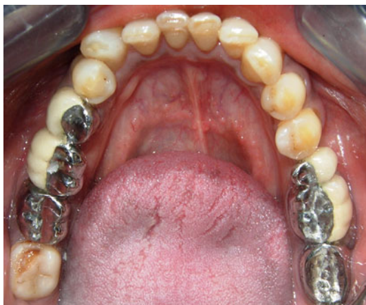
Fig. 9 Post-insertion mandibular view

dimension of approximately 2.5 mm as planned. The patient was kept on an interim phase of about 6 weeks with regular review to check for any subjective symptoms of TMJ discomfort. Patient's esthetics and phonetics were checked and found appropriate. The final prosthetic phase commenced after 6 weeks. Elastomeric impressions