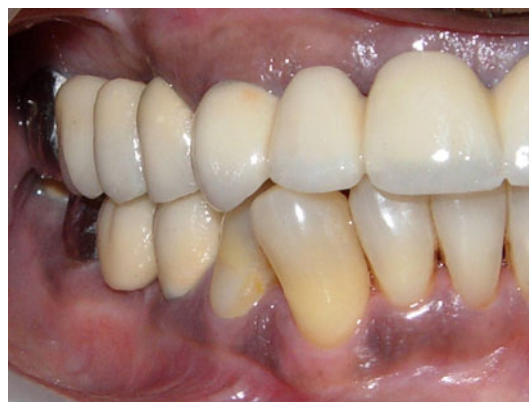
Fig. 11 Post-op intraoral view ( right side )

(ESPE-3 M addition poly-silicon) were made and multiple dies fabricated. Orientation relation was recorded and transferred to a semi-adjustable articulator (Hanau-H2) with the help of a spring face bow transfer (Fig. 7). Mounting of casts was done followed by protrusive and lateral records. To regain the vertical dimension of occlusion the incisal pin was dropped by 2.5 mm, as planned, and wax patterns fabricated accordingly. A canine protected occlusion was incorporated. The metal used for fabrication for copings was Bellabond Plus (company—Bego Bremer) with Belasum investment material and Begosol investment liquid. Copings were tried intraorally. The final restorations were cemented with luting glass ionomer cement. The patient was educated about the maintenance of oral hygiene (Figs. 8, 9, 10, 11, 12).