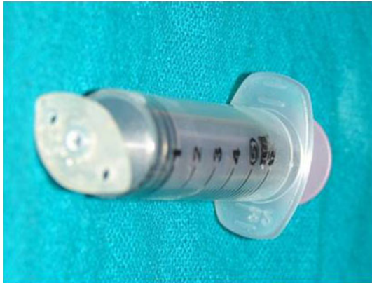
Fig. 1 Custom made impression tray

history revealed that the patient had suffered from chickenpox (Herpes Zoster Ophthalmicus) about 12–14 years back, resulting in pain and swelling of right eye for which took traditional medicaments. Consequently to this, the eye had shrunken.