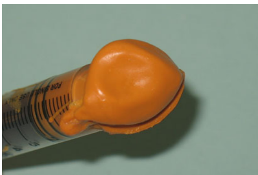
Fig. 2 Ocular impression