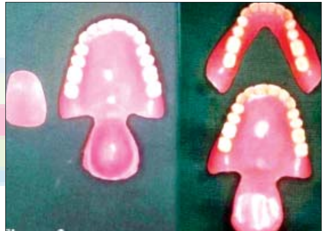
Figure 3: (Left) upper denture with hollow pharyngeal bulb and lid, (right) upper and lower finished dentures