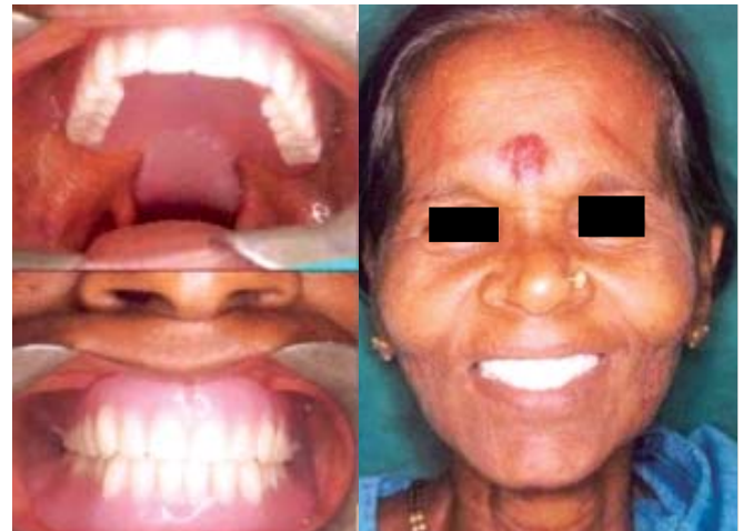
Figure 4: (Top left) intraoral view with prosthesis covering the defect, (bottom left) upper and lower dentures in occlusion, (right) postoperative frontal view