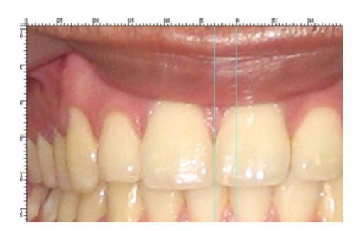
Photo 2 Deviation of facial midline with maxillary teeth midline on computer screen (3 mm)