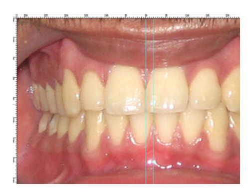
Photo 3 Deviation of maxillary & mandibular teeth midlines on computer screen (2 mm)

student co-incide with that on the image. Two points were marked on inner canthus of the eye at the medial border of the punctum using the 'Pen tool'. Guidelines were drawn on these points. The distance between the two points was measured and noted in millimeters as depicted in Photo 1. Facial midline was obtained by dropping the perpendicular to bisect the inter-canthal distance. Dental midline between the upper central incisors was obtained using the guide tool. The deviation between the facial midline and the maxillary dental midline was noted in millimeters as depicted in Photo 2. In the same manner deviation between