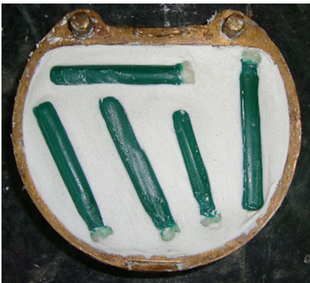
Fig. 1 Flasking of Green-stick wax along with acrylic teeth

wax (MAARC GREEN Tracing Sticks). Green-stick wax was then softened at one of its tip and acrylic tooth was embedded to that tip. Sticks of green compound were used as a mold pattern because of their uniform diameter and because their thermoplastic properties allowed them to be flaked and later boiled out in the same manner as a denture wax-up [2]. Optimum amount of dental plaster (Universal's Dental Plaster) was then mixed with water and poured into a flask. Green-stick with attached tooth was invested horizontally in the dental plaster. 5–6 such samples were placed in each flask (Fig. 1). After the plaster had set the flask was placed in boiling water for 10 min for de-waxing. Following wax elimination the tooth remained embedded in plaster adjacent to the mould space (Fig. 2). Liquid and powder of heat-cured acrylic (DPI Heat cure) were then mixed according to the manufacturer's instructions and