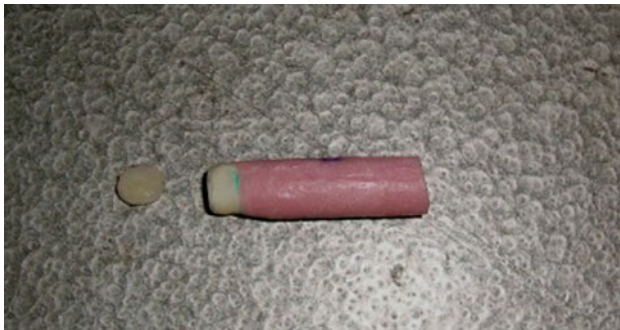
Fig. 6 Fractured sample