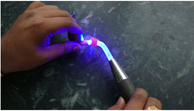
Fig. 4 Light curing of composite resin placed on surface treated denture teeth