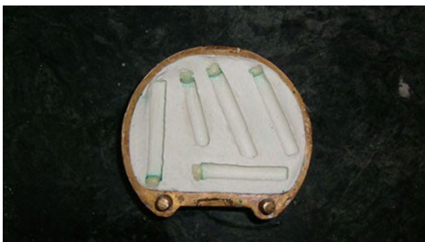
Fig. 2 Mold space with denture teeth after dewaxing