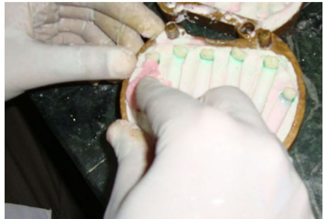
Fig. 3 Packing of heat-cure acrylic resin into the mold space

packed into the mould space in dough stage (Fig. 3). After curing, cylindrical stick of acrylic resin with denture tooth attached on top was de-flaked [2]. The attached denture tooth was then milled to a diameter of 8 mm to standardize the bond surface area [3]. The occlusal surface of the denture tooth was ground with burs first and then with silicon carbide papers.