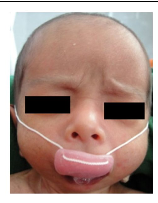
Fig. 5 Case 1, Prosthesis in place