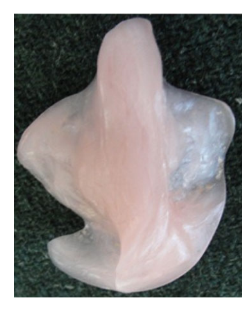
Fig. 9 Case 2, Heat cure prosthesis