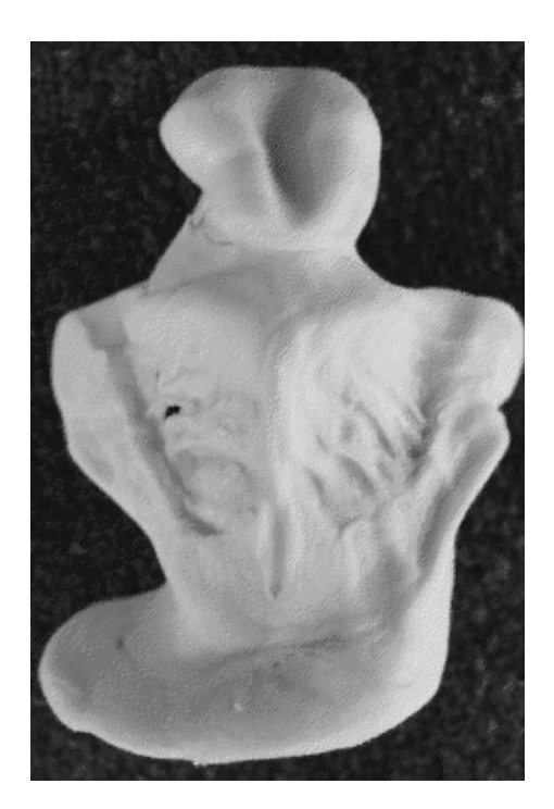
Fig. 2 Case 1, Impression

tongue (glossoptosis) and upper airway obstruction. Incomplete closure of the roof of the mouth (cleft palate) is present in majority of patients and is commonly U-shaped.