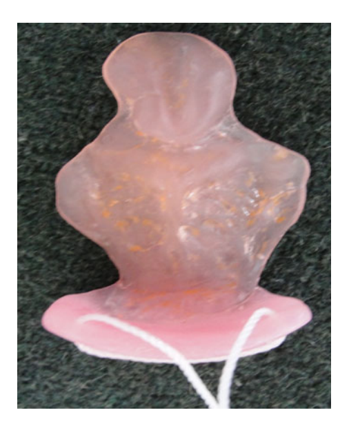
Fig. 4 Case 1, Heat cure prosthesis

choking of impression material in the throat and to prevent difficulty in breathing. Beading and boxing of the impression was made to obtain master cast in die stone. Outline of the prosthesis was marked and wax up was done accordingly using modeling wax (Fig. 3). Wax pattern was flasked and cured by conventional method to obtain heat cure acrylic resin prosthesis. After curing the prosthesis was retrieved; excess resin was trimmed and prosthesis was finished and polished (Fig. 4). The prosthesis was stored overnight under water to reduce residual monomer. Next day the prosthesis was tried in baby's mouth, adjusted for accurate fit and delivered (Fig. 5).