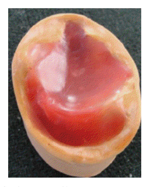
Fig. 8 Case 2, Master cast with wax pattern

patient's mouth for fit and for any airway obstruction. A groove was made in the prosthesis to prevent obstruction to the air passage (Fig. 10).