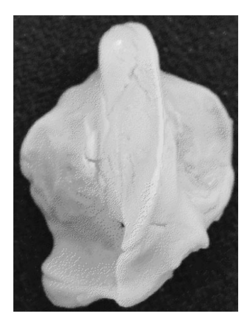
Fig. 7 Case 2, Impression

Two month old baby boy weighing 1.2 kg reported to our department with similar complaints. On examination baby was underweight for his age due to difficulty in feeding. Extra oral examination showed deviated nasal septum on the right side causing gross facial asymmetry. Intra oral examination showed defect located on the left side of premaxillary region involving upper lip, alveolus, hard palate and soft palate (Fig. 6). Baby had developed compensatory tongue thrusting habit to seal the defect. Prosthetic intervention was planned as immediate treatment since the surgery was postponed as the baby was underweight. Prosthetic rehabilitation was aimed at closing the defect to facilitate proper feeding and to prevent nasal regurgitation and also to break abnormal oral habit. Heat cure prosthesis (Figs. 7, 8, 9).was fabricated in the similar manner as that of the first case. Prosthesis was checked in