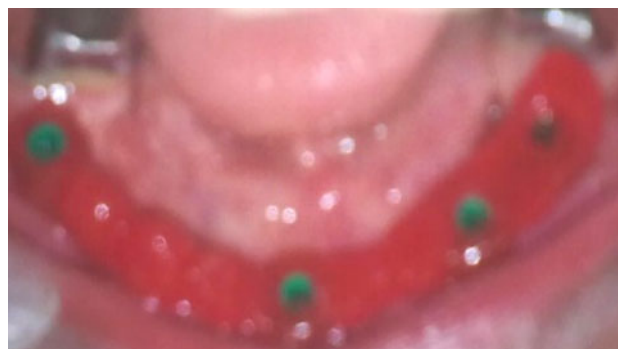
Fig. 7 Resin pattern tried in patient mouth

vascularised free fibular flap (13 cases) and noticed that less complication rate and superior functional and aesthetic results were achieved for those with fibular flap. Chana et al. [5] in their series of 10 cases utilized vascularised fibula flap with simultaneous placement of osseointegrated dental implants and claimed it is the ideal treatment for large ameloblastoma. Becelli et al. [8] elucidate two phases in the reconstruction process which are first, the phase of