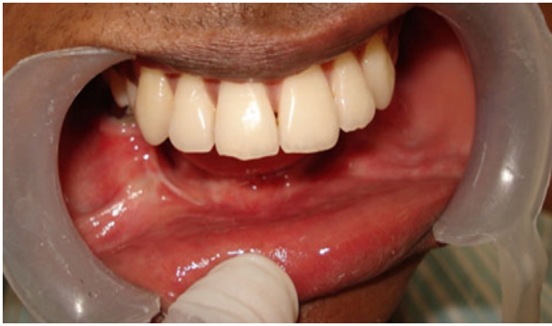
Fig. 1 Pre-operative view