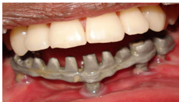
Fig. 8 Metal framework try in done