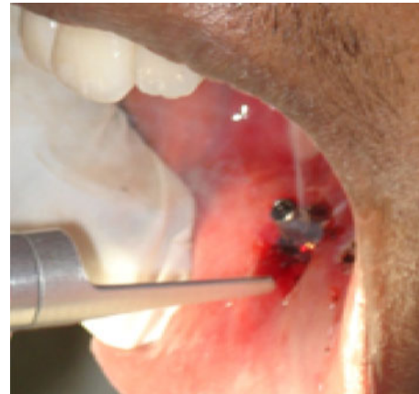
Fig. 3 Surgical excision

The resin pattern was invested, casting was done using cor alloy and framework was fabricated. This framework was