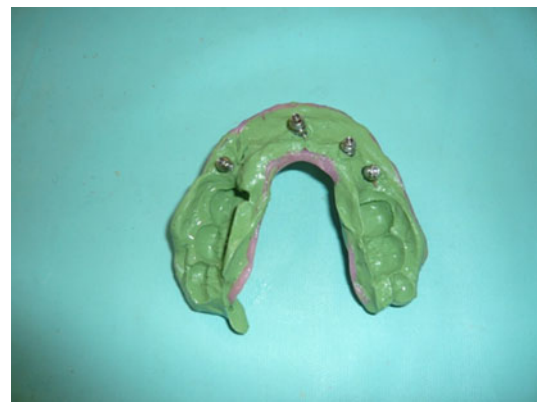
Fig. 4 Impression with transfer coping

subsequently tried in patients mouth and checked for the fit of the framework on the implant for the occlusal clearance. Metal ceramic restorations were fabricated, tried in patient's mouth & cemented using interim luting cement. Gingival portion was added to the framework where ever it was required to enhance esthetics (Figs. 7, 8, 9).