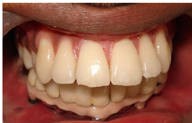
Fig. 9 Framework with gingival porcelain and crown cemented

reconstruction of the surgical defect with free or autogenous bone graft or revascularized autogenous bone graft and the subsequent phase which is carried out to obtain prosthetic restoration by means of endosseous implants.