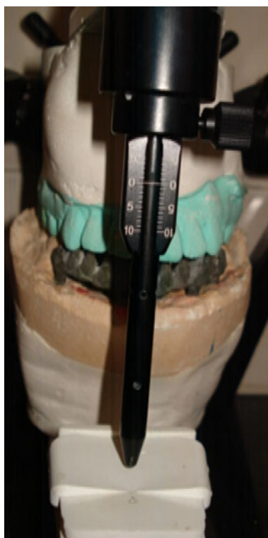
Fig. 6 Mounted casts on articulator

vascularised free fibular flap (13 cases) and noticed that less complication rate and superior functional and aesthetic results were achieved for those with fibular flap. Chana et al. [5] in their series of 10 cases utilized vascularised fibula flap with simultaneous placement of osseointegrated dental implants and claimed it is the ideal treatment for large ameloblastoma. Becelli et al. [8] elucidate two phases in the reconstruction process which are first, the phase of