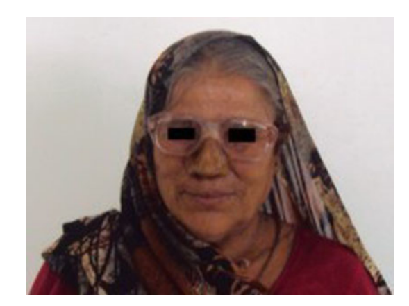
Fig. 6 Patient with nasal prosthesis attached to glass frame

The patient was scheduled for the first post-insertion adjustment 1 day after the insertion to ensure health of the tissues and to relieve the prosthesis for pressure areas on the tissues.