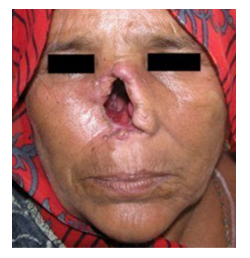
Fig. 1 Frontal view of patient after partial rhinectomy

modalities ranging from acrylic resin nasal prosthesis to implant retained silicone prosthesis were explained and discussed with the patient. Due to economic constraints, the patient chose a nasal prosthesis made of acrylic resin. The fabrication of a PolyMethyl Meth Acrylate (PMMA) resin nasal prosthesis was planned, and the outcome of this treatment was explained to the patient. It was decided to use a spectacle glass frame for retaining the prosthesis.