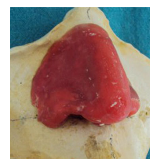
Fig. 3 Wax pattern carved on working model in baseplate wax