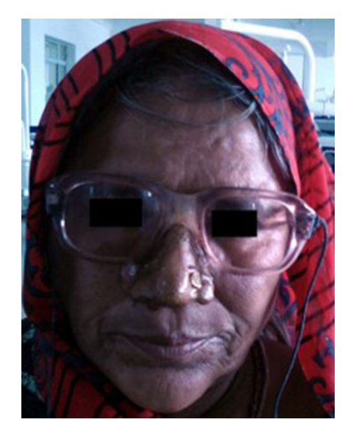
Fig. 7 Patient with customised nasal prosthesis with nose piece

At the follow-up evaluation after 4 weeks, the prosthesis appeared to be functioning within normal limits. The patient indicated that she was satisfied with the results of