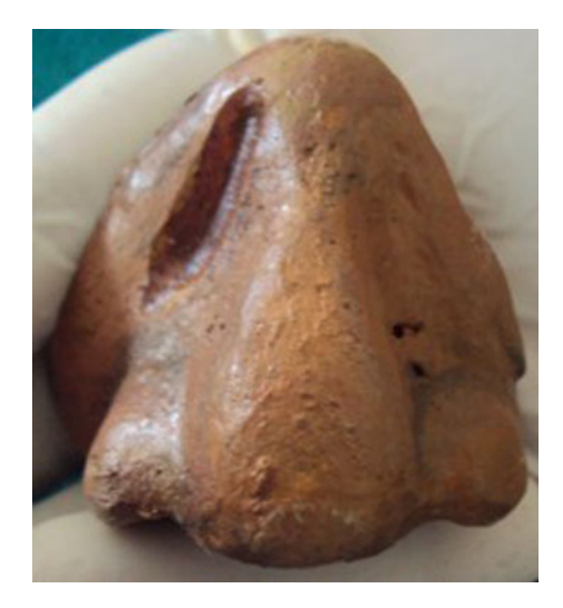
Fig. 4 Prosthesis after extrinsic coloring