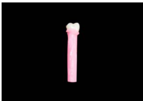
Fig. 3 Acrylic rods

The specimen tooth along with the attached rods were weighed. Weight of each specimen was measured using the electronic balance (Contech CA Series) up to accuracy of 10^{-4} Gm, and volume of the specimen was checked using a measuring glass. The specimen was held stationary on the apparatus with the help of screws. The wear testing procedure was carried out for each specimen under an applied load of 0.20 kg throughout the wear cycle. The specimens were ground with 600 grit silicon carbide paper, which was attached to the surface of the disc on the apparatus (Fig. 4). Each specimen was subjected to 5,000 cycles (5.18 min), after which it was removed from the testing device along with the holder cleansed of all debris and weighed in the electronic balance to weigh the difference in weight before and after 5,000 cycles. Each specimen was then replaced