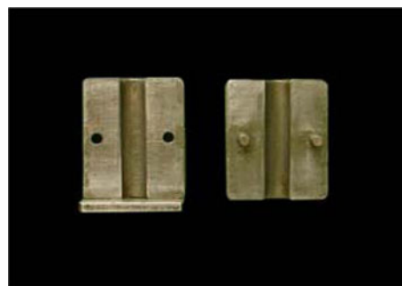
Fig. 2 Steel split mould

The rod was made from steel split mould with a cylindrical space of 7 mm in diameter and 35 mm in length (Fig. 2). Modelling wax was melted into the mould space to obtain wax rods of the same dimension. These wax rods were invested in Type III dental stone. Type III dental stone was mixed according to the manufacturer's water powder ratio and filled in one half of the complete denture flask. The wax patterns were immersed halfway into the unset dental stone. Once the stone was set, upper half of the flask was filled with stone and the flask was closed under bench press. The flask was then dewaxed and the two halves of the flask were separated. Separating medium was applied in the mold space. Cold-cure acrylic resin was mixed. The acrylic resin was packed into the mold space in the dough