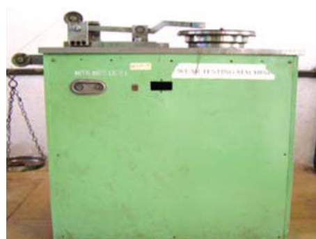
Fig. 1 Wear and friction monitor, Ducom

Density can be obtained by weighing the teeth and by measuring the volume of the teeth. The weight of the teeth was obtained by weighing the teeth in an electronic balance (Contech CA Series). The volume of the teeth was obtained by using a measuring glass, which could read up to 0.2 cc accurately. The measuring glass was filled up with water up to 5 cc for initial reading. The tooth was immersed and a