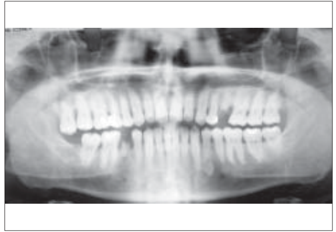
Figure 2: Preoperative OPG