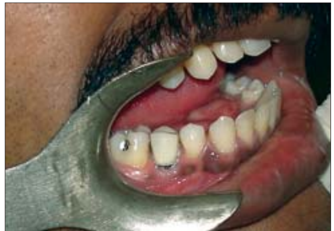
Figure 6: Metal ceramic implant crown cemented

were highly satisfied with immediate implant-supported prostheses over fixed bridges and soft tissue supported prostheses. As research avenues span across newer surgical techniques and material