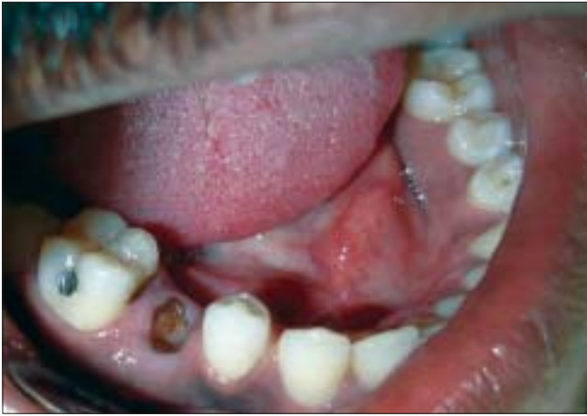
Figure 1: Preoperative intraoral view