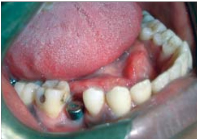
Figure 5: Gingival former in place