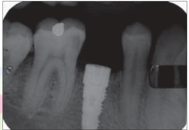
Figure 4: Postoperative IOPA