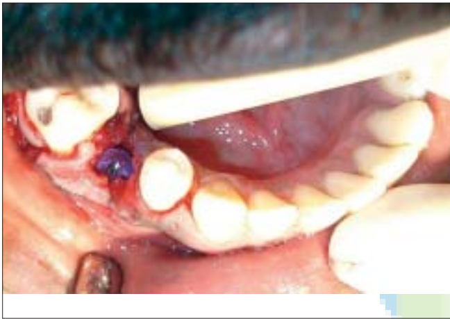
Figure 3: Implant with cover screw in place