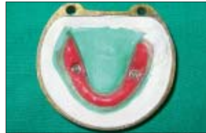
Figure 4: Male portion of snap on button and modeling wax adapted to the tissue bearing plate