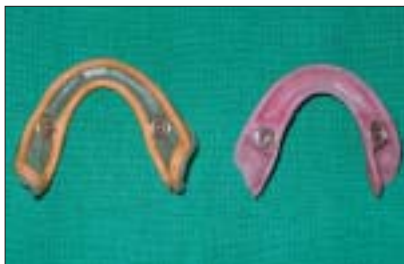
Figure 7: The two plates together with sponge attached to tissue bearing plate