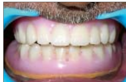
Figure 8: Post-treatment intraoral view