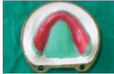
Figure 2: Two mm wax adapted over mandibular cast with bevel created at periphery