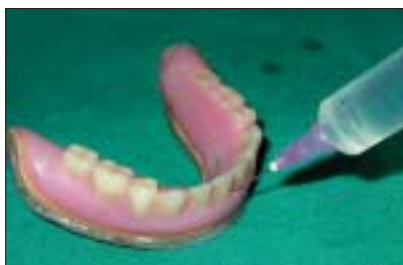
Figure 9: Filling of salivary substitute with needle and syringe

size similar to the thickness of a 26-gauge needle. Also an inlet hole of diameter similar to a 19 gauge needle was made in the teeth bearing plate labially just between the two central incisors [Figure 8].