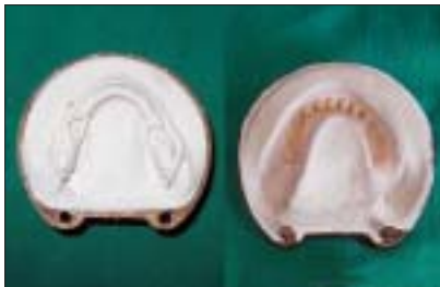
Figure 5: New base flask closed against counter of first flask