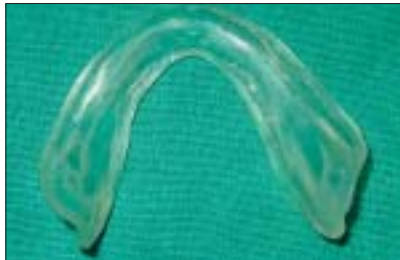
Figure 3: Clear tissue bearing plate