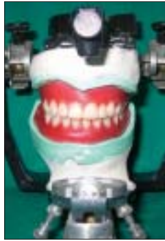
Figure 1: Adding bulk to the lower trial denture