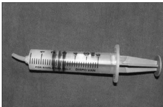
Figure 1: Petroleum jelly loaded in a disposable syringe