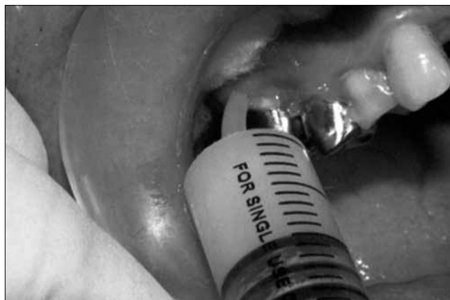
Figure 2: Petroleum jelly applied to the circumference of the crown margin