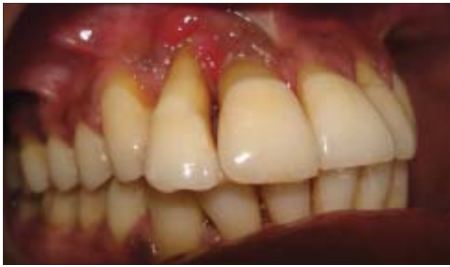
Figure 1: Preoperative Intraoral view