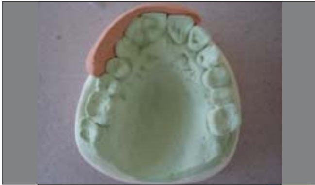
Figure 3: Putty matrix sectioned incisally