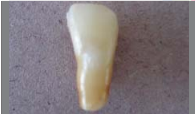
Figure 5: Contoured natural tooth pontic