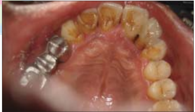
Figure 6: Postoperative palatal view of splinted tooth