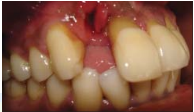
Figure 4: Post extraction Intraoral view