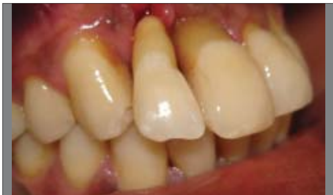
Figure 7: Postoperative labial view