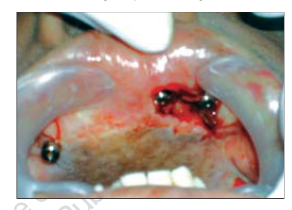
Figure 6: Second Stage - Implant surgery