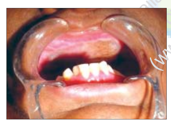
Figure 3: Postoperative - intra oral