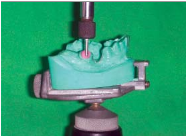
Figure 2: Shank of the bur attached to the matrix with the surveyor in place

essential to accurately transfer the parallel guiding planes achieved on the diagnostic casts to the natural tooth. However, this is a challenging task. Several authors have used various techniques to achieve parallel guiding planes.