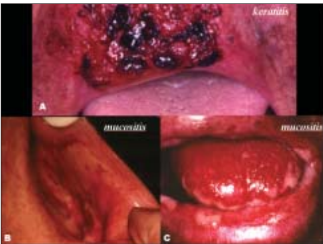
Figure 3: Post-irradiation keratitis and mucositis

in the literature from 0.4% to 56%. [19] Although osteoradionecrosis occurs typically in the first three years after radiation therapy, patients probably remain at indefinite risk. Factors that may be associated with the risk of osteoradionecrosis include treatment-related variables such as radiation therapy dose, field size and volume of the mandible irradiated with a high dose; patient-related variables such as periodontitis, pre-irradiation bone surgery, oral hygiene, alcohol and tobacco abuse and dental extraction following radiation therapy and tumor-related factors such as lesion size and lesion proximity to bone.