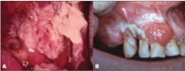
Figure 1: Clinical features of advanced oral squamous cell carcinoma. A. Buccal mucosa – note the mixed leukoplakia and erythroplakia (white and red patches) in this case; B. Gingival carcinoma