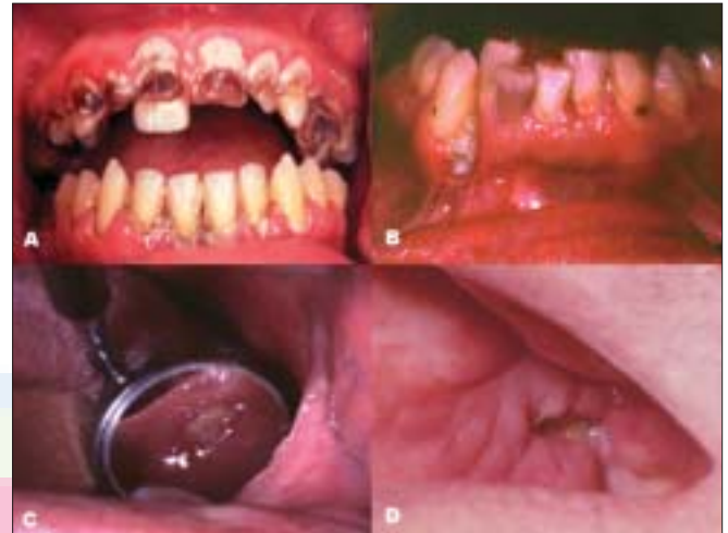
Figure 4: “Radiation caries” can result from reduced salivary flow and discomfort in tooth brushing due to mucositis (A). Necrotic bone sequestration is an ominous sign of osteoradionecrosis post-radiation to the jaws (C-D).

in the literature from 0.4% to 56%. [19] Although osteoradionecrosis occurs typically in the first three years after radiation therapy, patients probably remain at indefinite risk. Factors that may be associated with the risk of osteoradionecrosis include treatment-related variables such as radiation therapy dose, field size and volume of the mandible irradiated with a high dose; patient-related variables such as periodontitis, pre-irradiation bone surgery, oral hygiene, alcohol and tobacco abuse and dental extraction following radiation therapy and tumor-related factors such as lesion size and lesion proximity to bone.