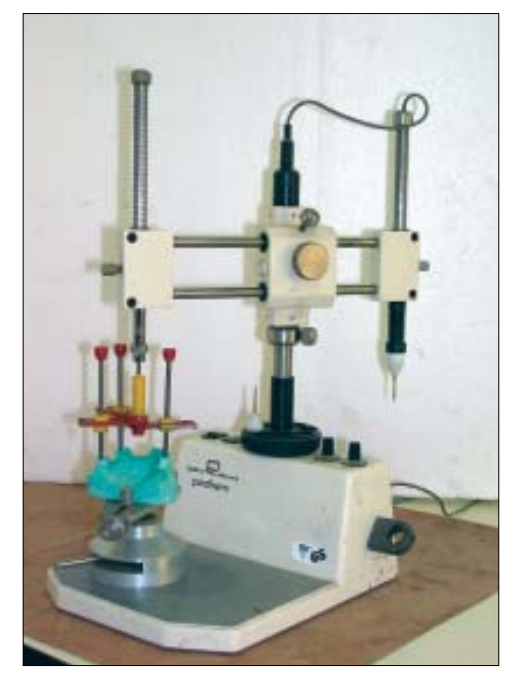
Figure 3: The Tripoder attachment mounted on surveyor and positioned on cast

5. Use of this instrument can eliminate many errors that may happen during lab authorization.