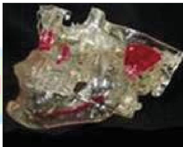
Figure 3: SLA (stereolithographic anatomic) models for mock surgery