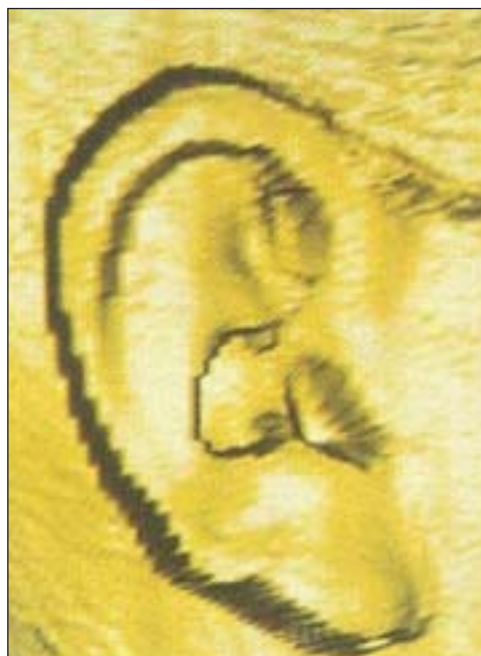
Figure 2: Model ear milled from a block of polyurethane using 3-axes milling machine