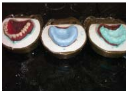
Figure 4: Coring the denture with different materials

The dentures were de-invested following the sectional method to avoid distortion of the acrylic resin. To visualize the movement in the teeth position in the processed dentures [Figure 5] measurements were taken at the same points specified and marked at the waxed up denture stage. These readings were tabulated. The reading of the processed dentures were compared with the reading of the waxed up denture to note the movement occurring during processing