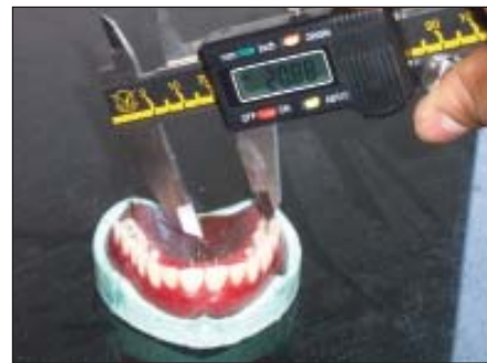
Figure 3: Measurement of distance between reference points by vernier caliper

The following precautions were necessary during Investing and Processing: