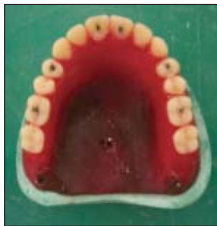
Figure 2: Stainless steel pins in position