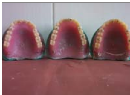
Figure 5: Marking of processed dentures to visualise smooth movement